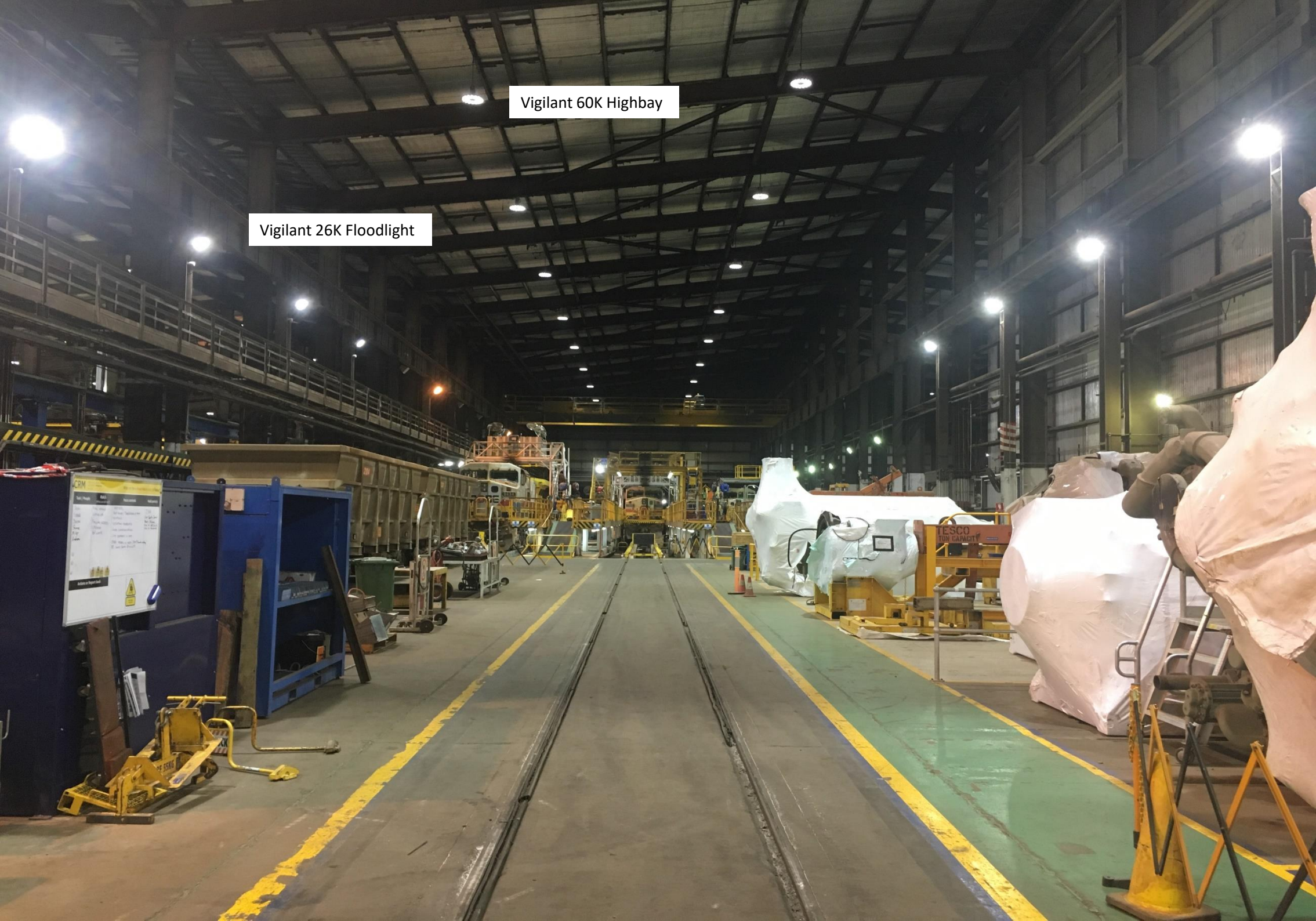
Vigilant 26K Floodlight