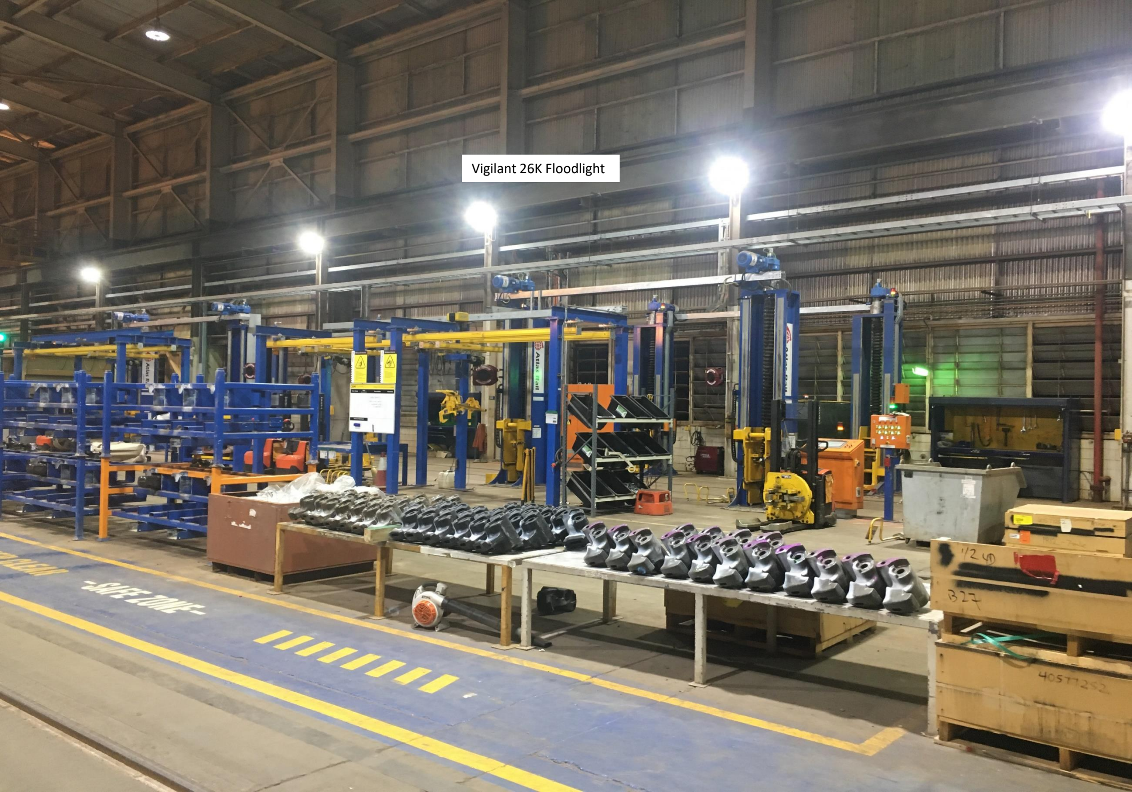
Vigilant 26K Floodlight