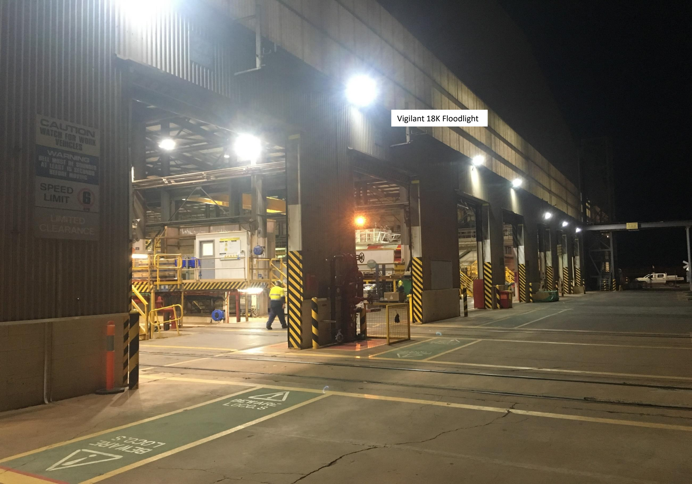
Vigilant 18K Floodlight