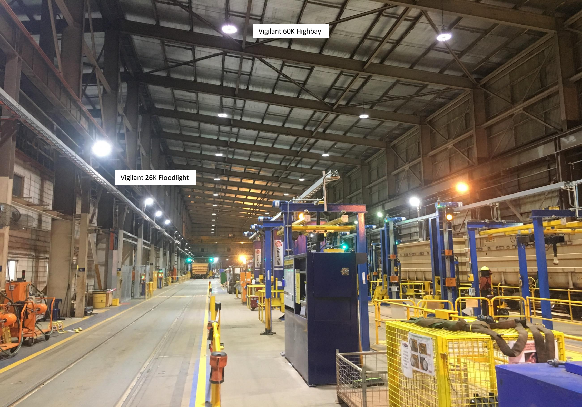
Vigilant 26K Floodlight