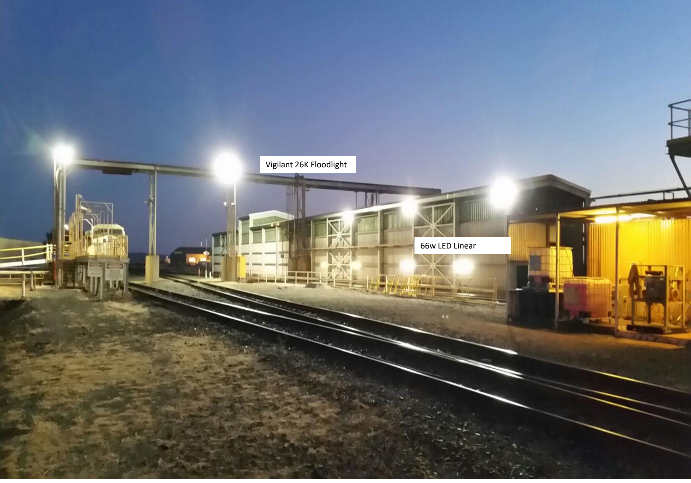
Vigilant 26K Floodlight